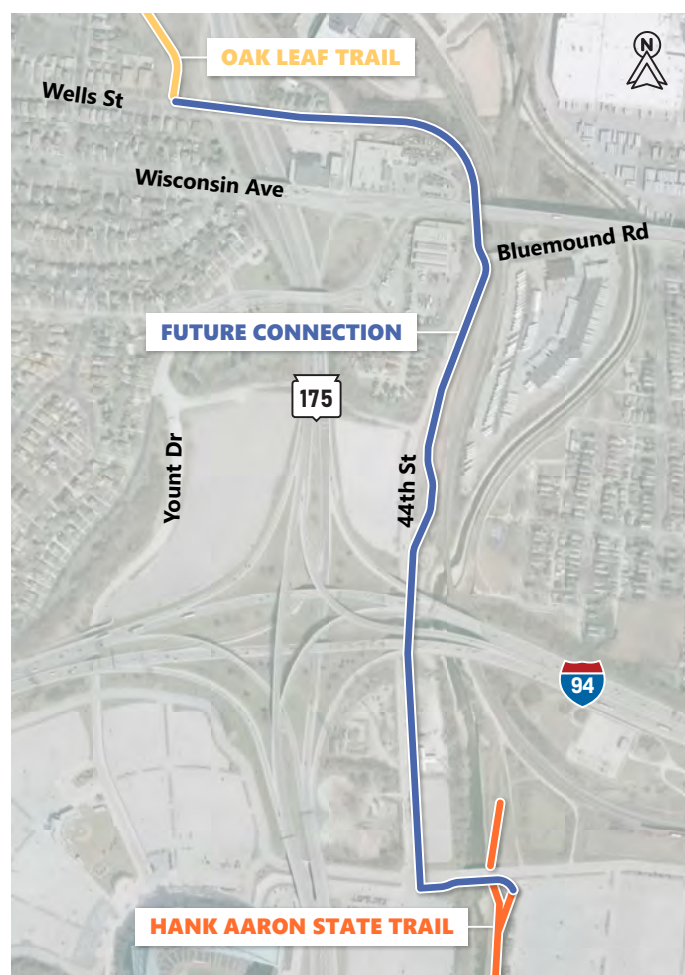
Hank Aaron State Trail and Oak Leaf Trail connection

WisDOT and its transit partners will finalize plans after a preferred alternative is identified and approved by the Federal Highway Administration. Metrics will be developed to judge success of the funding and flexibility will be built into the program to adjust funding to the most needed and successful components throughout construction.